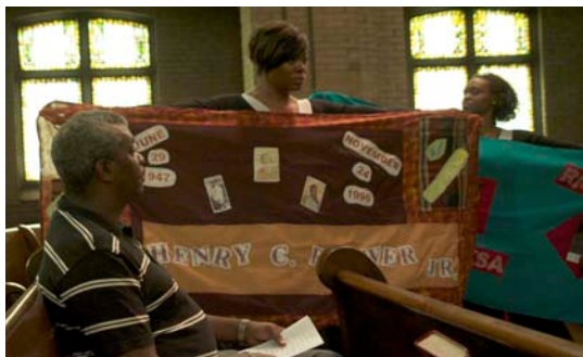
Members of the Amazing Grace Dance Company display remembrance quilts during their performance at the memorial service.